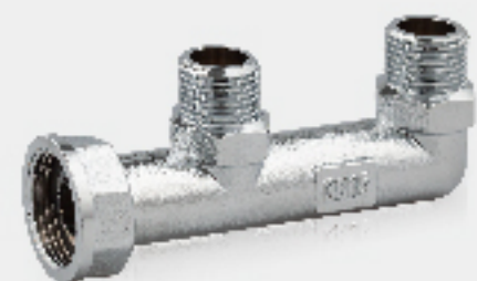
GA-301 F型三通分路器 F Shape Tee

高端燃气产品集成供应商 TOP SUPPLIER OF GAS HOSE PRODUCT