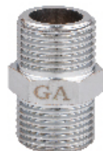
GA-309 外牙对丝 Brass Nipple