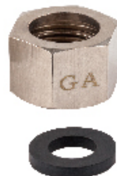
GA-307 简易螺母 Simple Female Connector For Gas Hose