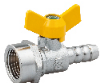
GA-406 内牙插管煤气管球阀 Female Hose Gas Valve