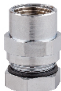
GA-304 内螺纹燃气表用套筒 Female Gas Meter Union