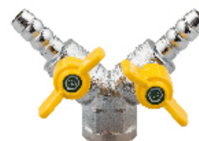
GA-411 内牙双叉球阀 Female 2 Way Hose Valve