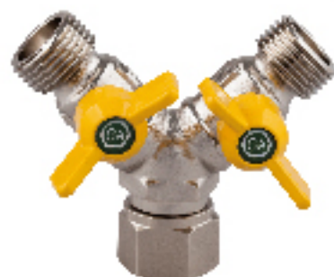
GA-409 内牙活接双外丝球阀 Female Union Hose Valve