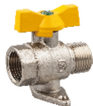
GA-404 带座内外牙煤气管球阀 Seated Male And Female Gas Valve