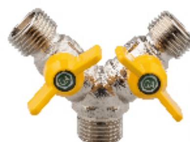
GA-410 三叉外牙球阀 Male Valve 3 Ways