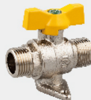
GA-403 带座外牙煤气管球阀 Sealed Male Gas Valve