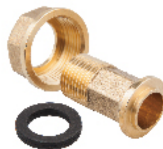
GA-313 煤气表接头 Gas Meter Connector