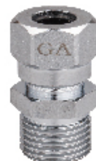
GA-311 插管活接 Union Connector For Gas Hose