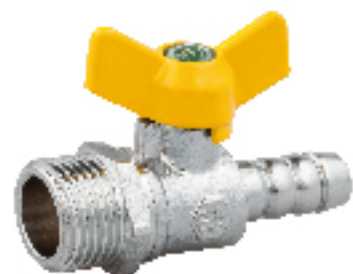
GA-405 外牙插管煤气管球阀 Male Hose Gas Valve