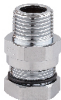
GA-305 外螺纹燃气表用套筒 Male Gas Meter Union