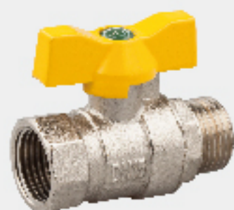
GA-401 内外牙煤气管球阀 Male And Female Gas Valve