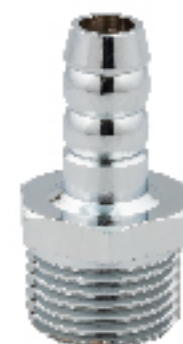
GA-312 外丝出气嘴 Male Hose Nozzle