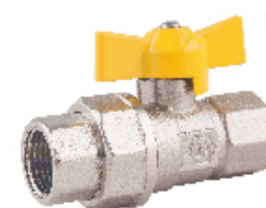
GA-415 壁挂炉活接球阀 Gas Boiler Union Valve