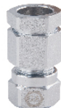
GA-314 插入式接头 Inserted Connector