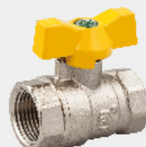
GA-402 两内煤气管球阀 Female Gas Valve

F \frac{1}{2} *M \frac{1}{2} F \frac{3}{4} *M \frac{3}{4}