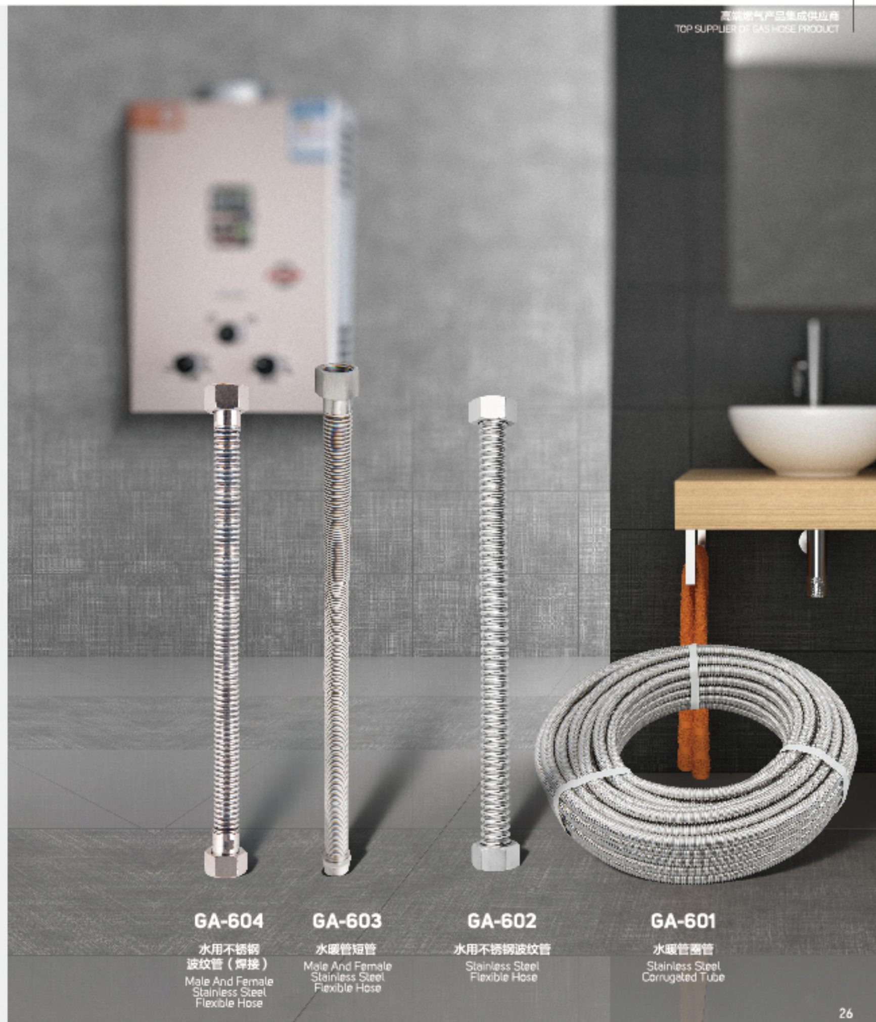
GA-604 水用不锈钢 波纹管（焊接） Male And Female Stainless Steel Flexible Hose