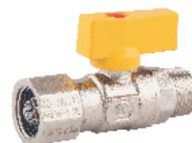
GA-413 温控流量控制阀 Temperature Auto Flow Control Valve