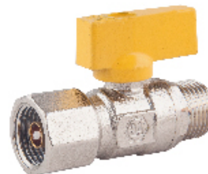
GA-414 流量控制阀 Flow Control Valve