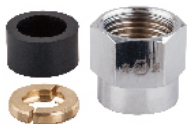
GA-308 燃气管螺母 Female Connector For Gas Hose