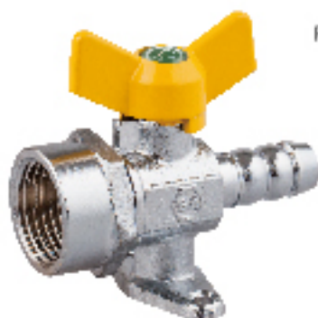
GA-407 带座内牙插管球阀 Female Hose Seated Gas Valve