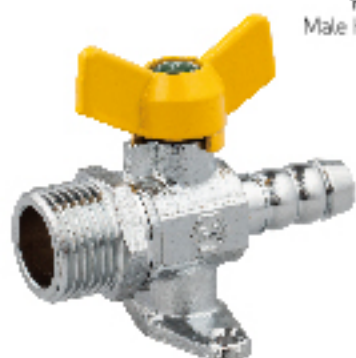
GA-408 带座外牙插管球阀 Male Hose Seated Gas Valve