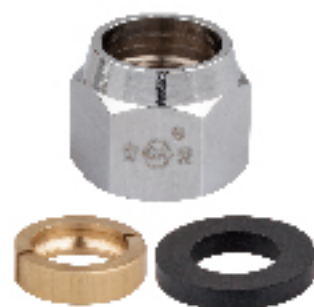
GA-306 燃气管螺母 Female Connector For Gas Hose