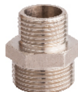
GA-310 异径对接 Reducing Nipple