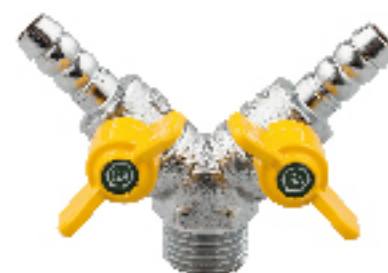
GA-412 外牙双叉球阀 Male 2 Way Hose Valve