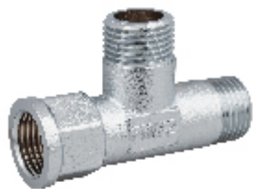
GA-303 一内二外三通 Male and Female Tee